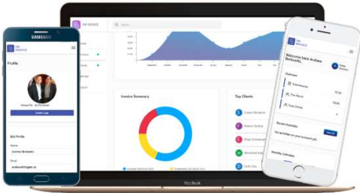
Award-winning Blockchain invoicing and payments tool